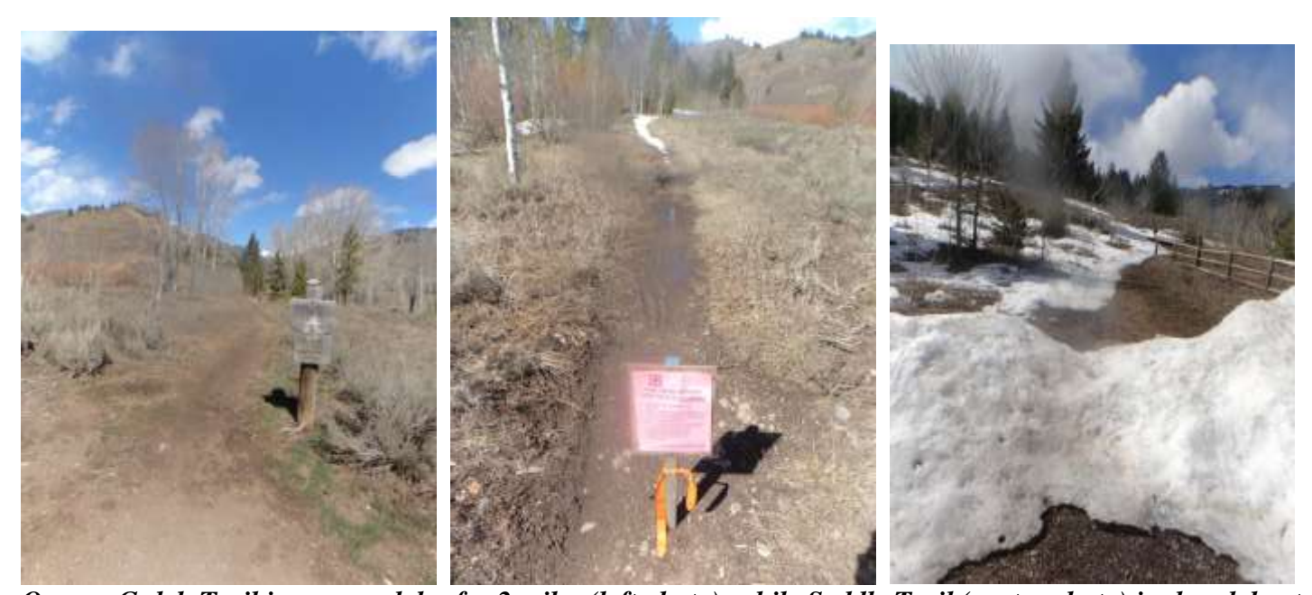
Oregon Gulch Trail is open and dry for 2 miles (left photo), while Saddle Trail (center photo) is closed due to mud and Chocolate Gulch (right photo) is weeks away from opening.