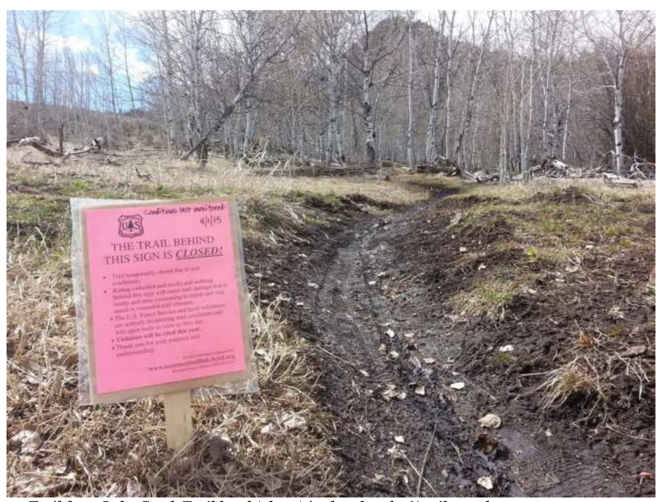
Harpers Trail from Lake Creek Trail head (above) is closed at the 1/4 mile mark.