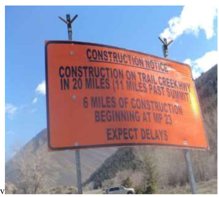
Eagle Creek Road remains closed and snow bound (above left). The north side of Trail Creek Road (over Trail Creek Summit) will be under construction this summer. A sign announcing the construction is posted 2 miles north of Sun Valley on Trail Creek Road. However, please note: Trail Creek Road is not expected to open over the summit until late April (at which time there may be delays due to construction).

Ketchum Ranger District Road Conditions: All KRD Forest Roads are closed to motorized use until MAY 1, after May 1 roads will be opened as conditions allow.