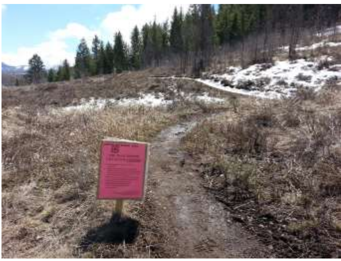
Old Adams Gulch Road Trail (above left) is closed except for a "center section" which is open and can be ridden to make a loop from Sunnyside-Lanes Trail. Adams lake Creek Connector Trail (above right) is open for short hikes from both the Adams Gulch side and from the Lake Creek side but the middle portion of the trail is closed due to mud.