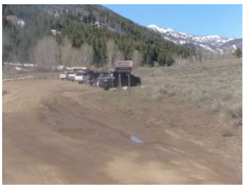
This hiker demonstrates how to stay in the center of a wet trail at Adams Gulch (left photo). Adams Gulch Trailhead is nearly dry with a number of south facing trails now open (right photo).