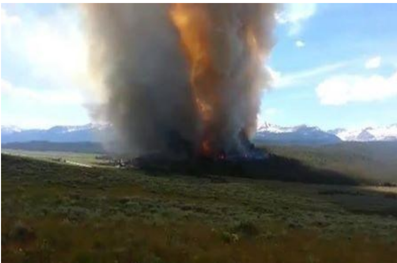
Hellroaring Fire, July 4, 2014