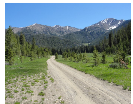
Cherry Creek near Galena