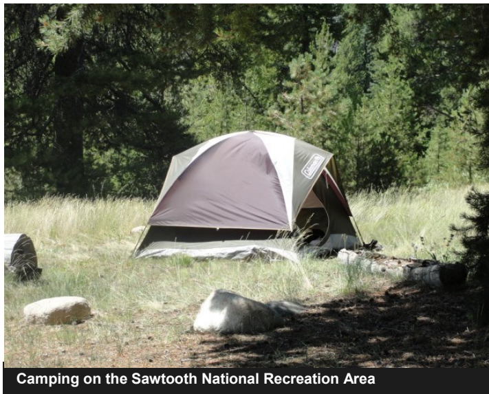
Camping on the Sawtooth National Recreation Area

Wild bears avoid people, but bears conditioned to human food can be aggressive and may be euthanized if problems occur.