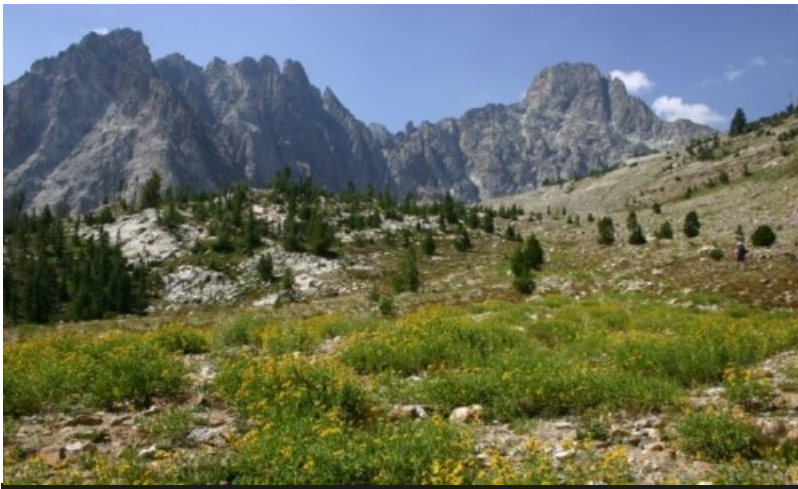
Thompson Peak, Sawtooth Mountains